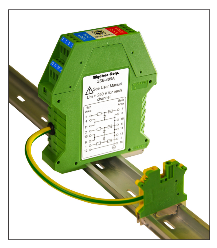
Note: DIN-Rail and DIN-Rail Grounding Block are sold separately.

The ZSB-409A safety barrier is intended for indoor or outdoor use in locations where the temperature does not exceed the specified range ( T_a ) of the safety barrier. The safety barrier must be installed in a safe area; typically in racks or control cabinets with an appropriate level of protection from dust and liquids. The ZSB-409A is designed for easy installation onto standard 35 mm DIN-Rail, and is fitted with an insulated wire for making the ground connection. Refer to Control Drawing No. Ex05121109 for further information on installation.